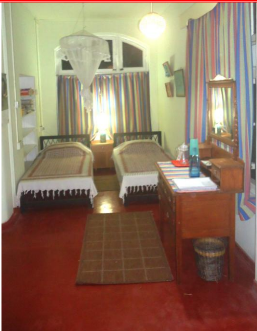
New layout in North-West corner of Nellie's Suite

For January, as in month's past, we'll continue our very popular "Sampler pack" of HPH-grown and -roasted coffee and a "Surprise Basket" of HPH "goodies" that appears to delight visitors as they take their leave of us and HPH!