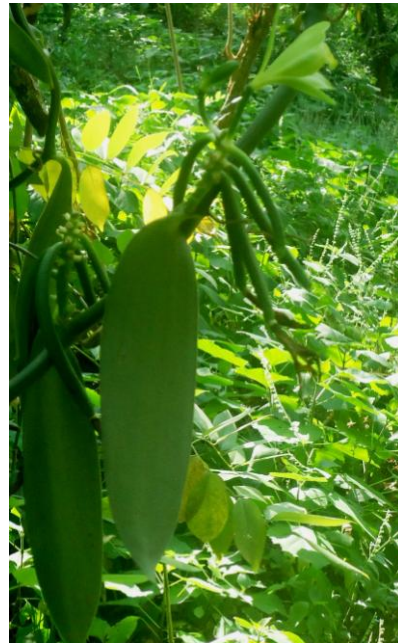
Vanilla beans AND flower. Climate change?

Please note that there is a minimum stay of 2 nights for each booking and we do not accept credit cards. Payment is accepted in US$, Sri Lankan rupees or any major currency at the prevailing exchange rate.