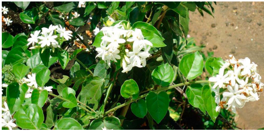
Jasmine creeper in bloom