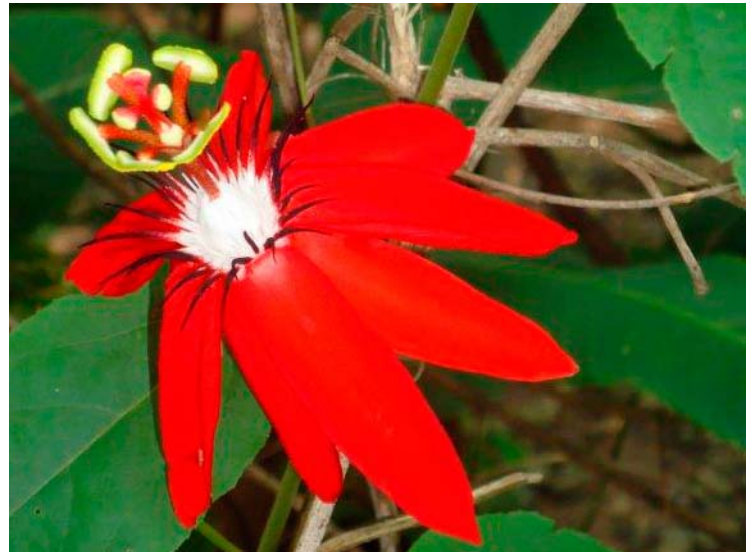
Red passion flower

boulders on the lower reaches of our water-supplying spring above the Soaking Pool will certainly prove a real joy, even if you happen to be approaching the three-quarter century mark that the author of this newsletter is! Yes, it is a delight and while we've made passage along it possible to those beyond the peak of physical fitness, we've maintained its environmental integrity, as is our primary goal in every endeavour of this kind at HPH. Try it when you visit us and you'll see that we do not exaggerate. Another simple pleasure awaits those negotiating this Path and that is a couple of rustic benches in the Nutmeg Grove at its start for those who'd like to read or just ruminate under the dense foliage of some of these beautiful trees.