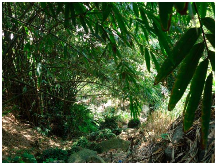
The Boulder Path from above