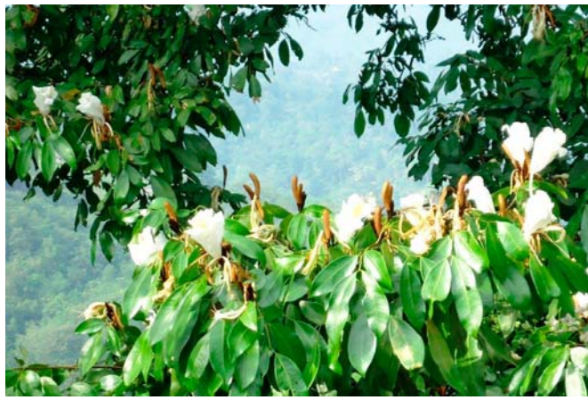
Baikiaea insignis flowers