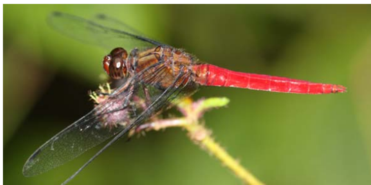
Orthetrum chrysis – one of the beautiful dragonflies seen at HPH

For the month of May we continue to provide each visiting group with a complimentary “Surprise Basket” of HPH “goodies” AND we are offering 50% off food and drinks for children under 12.