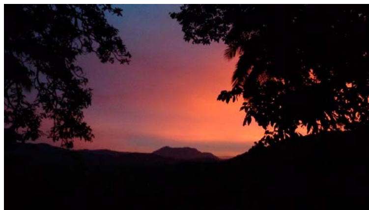
Sunset from the front veranda of HPH