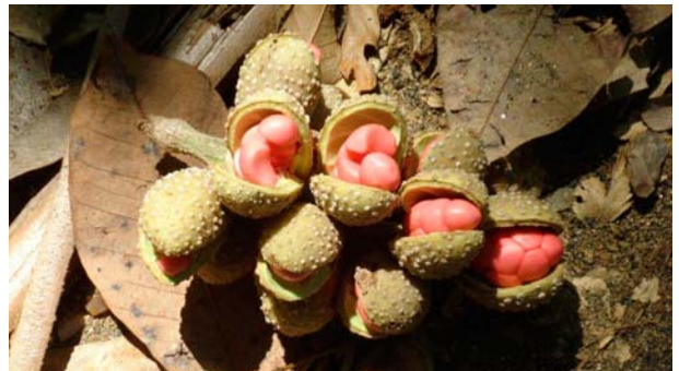
Champaca (sapu) seeds in their pods

Apropos of the Soaking Pool, the arch over much of the last bit of the path to it is coming along very nicely as are the “living hand rails” of wild lianas to assist those who need them. Yes, we will continue to live up to the promise of using nature’s bounty rather than chopping down and planting trees and shrubbery in an effort to “improve” on what is already there!