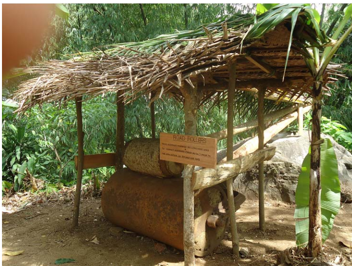
Road rollers with cadjan roof

A Belgian cousin, several times removed, has sent me the Armorial Crest/Coat of Arms of the van der Poorten family and I am taking the liberty of sticking it in this newsletter, though I can assure you that it is unlikely to be a permanent fixture on future ones!