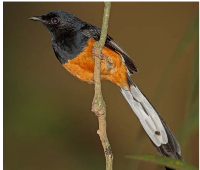
The Indian Shama.

For the first time ever I saw an Indian Shama ( Copsychus malabaricus ) as I was returning, at dusk from my evening constitutional. As well as being a handsome bird, the Shama is a beautiful singer as well. As I type this, an Ulama (Devil Bird/Forest Eagle Owl) is calling from one of the large trees in the garden at an unusually early (7:45 p.m.) hour. Apart from the migratory birds that arrive with the north-east monsoon and depart with the south-west monsoon, the varieties that comprise the “old faithful” stay around the garden all year round and are a source of unending pleasure to us and our visitors.