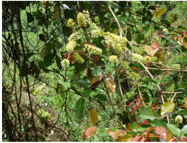
Combretum latifolium by the soaking pool